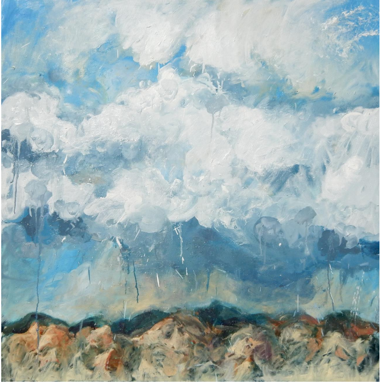
Of Sky and Earth – 2